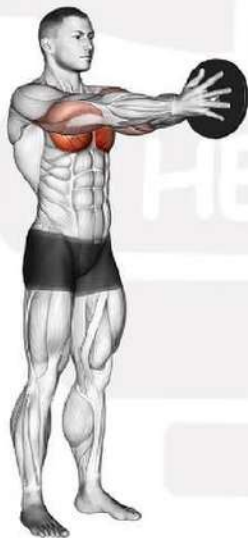
Lying/Standing Svend Press