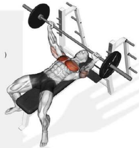
Flat/Decline Bench Press