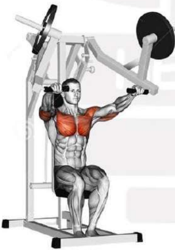
Iso-Lateral Bench Press Machine