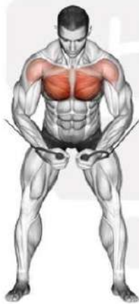
High Cable Crossover