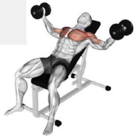
Incline DB Flys