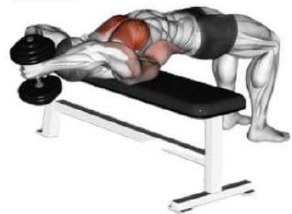
Lying DB Pullovers