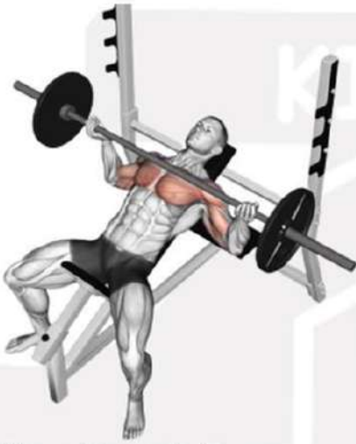
Incline Bench Press