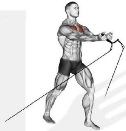
Low Cable Crossover