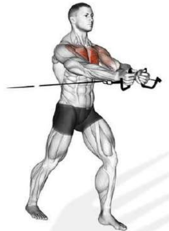
Cable Chest Press