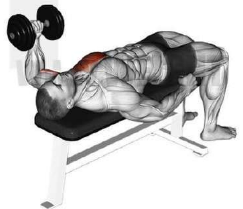
Single Handed Hammer Grip Chest Press